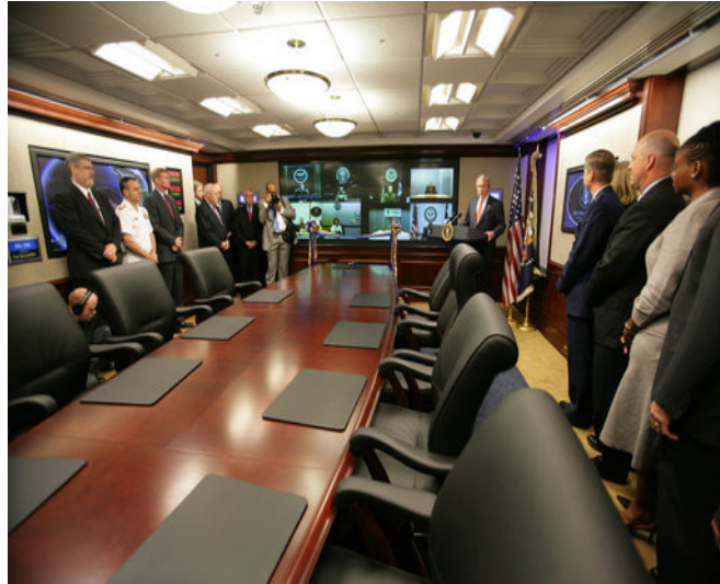
Current U.S. Situation Room