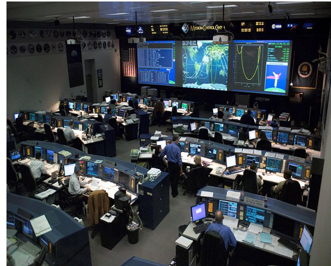
NASA Mission Command