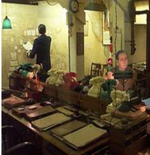
Churchill War Room.